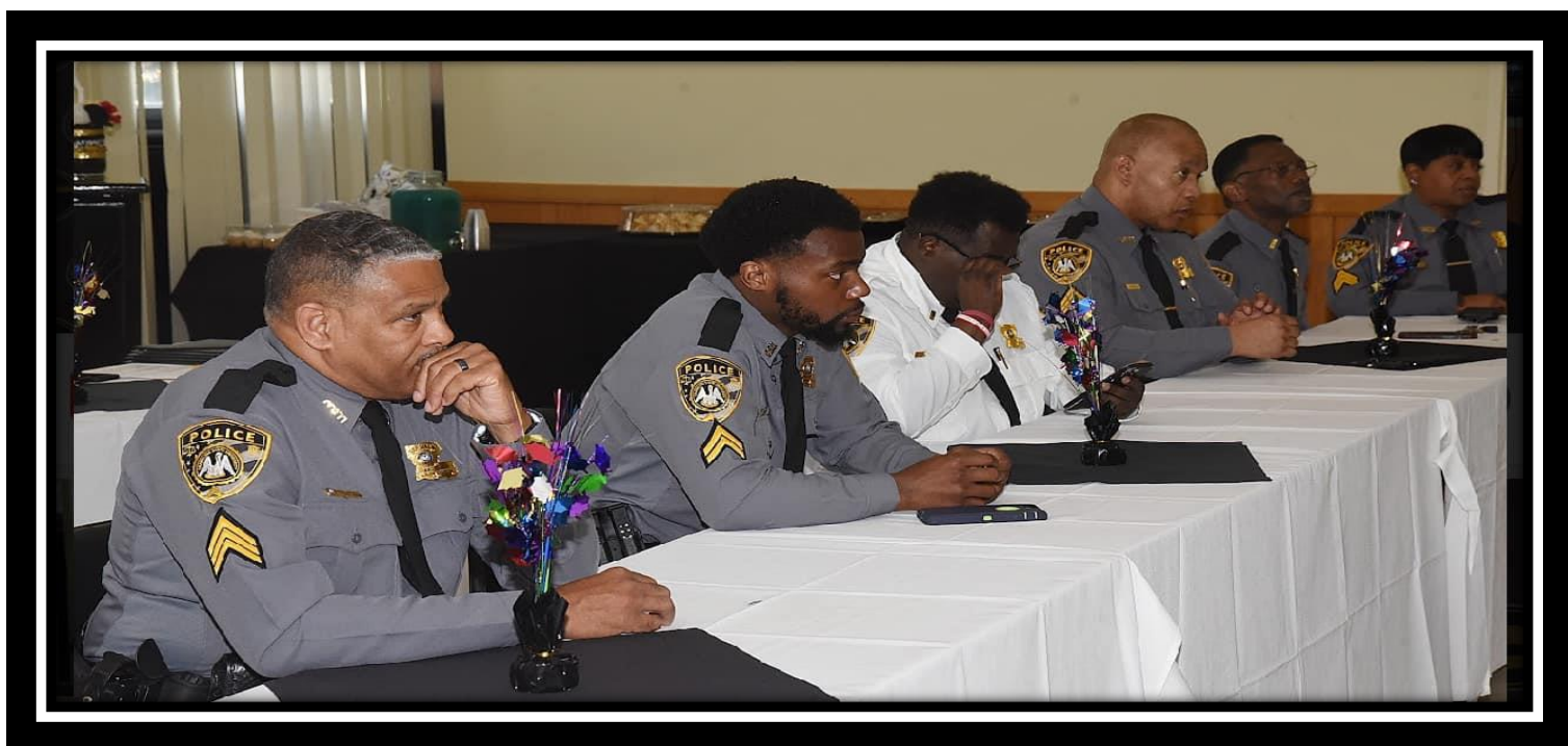
University Police Training

Campus community members can additionally report hazards directly to Facilities Management. The campus's overall safety and security program is supplemented by various technological systems, including; access control, closed-circuit television, emergency phones and fire detection, suppression, and reporting systems. Other members of the University community are helpful when they report equipment problems to GSUPD or Facilities Management.