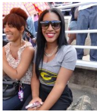
GSU Football Game