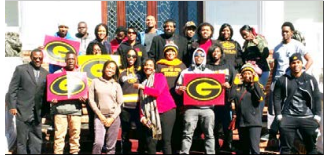
Grambling State University students stand in front of Ms. Rebecca's House (a Southern Antebellum Mansion on the Allen Institute campus).

Students were selected through an application process that included pitching a business in a Pitch competition or other activities during Entre-