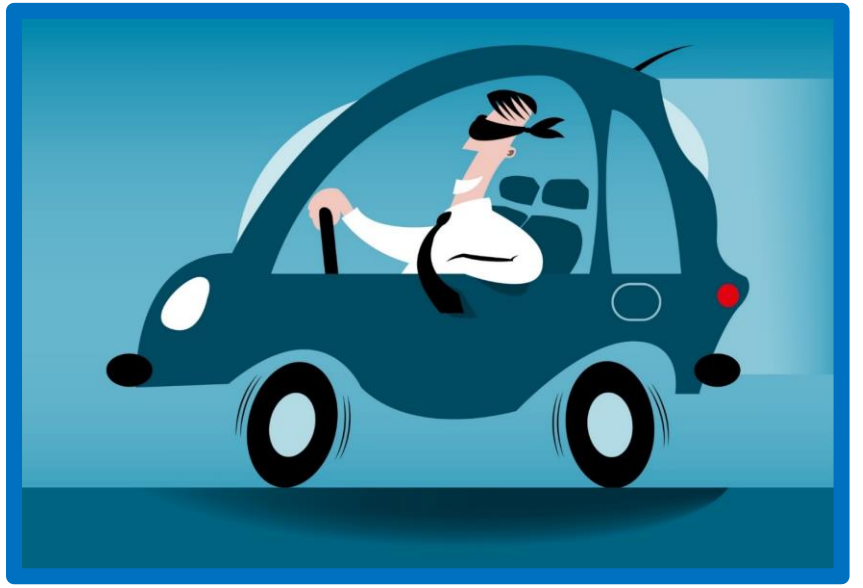
Motor Vehicle Safety Issues: Distracted Driving. National Safety Council/Injury Facts. November 2019. <u>https://injuryfacts.nsc.org/motor-vehicle/motor-vehicle-safety-issues/distracted-driving/</u>

In America, eight people die every day in distracted driving crashes